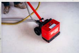
Use with MHS Floor Scabblers