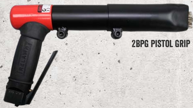
2BPG PISTOL GRIP