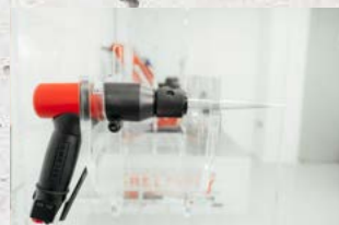
Available with Chisel Attachment