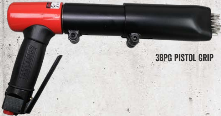
3BPG PISTOL GRIP