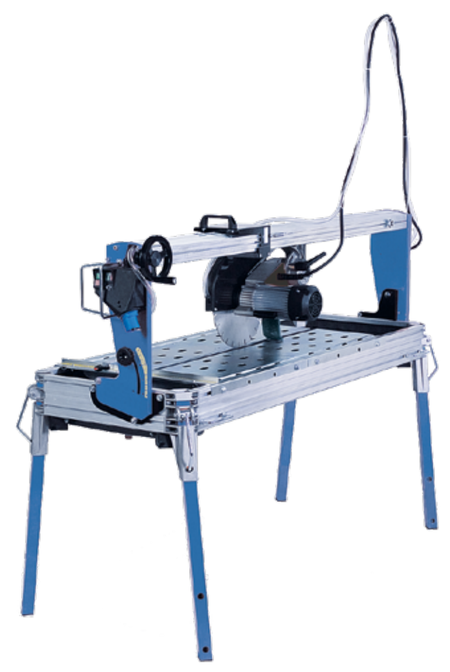
ATS 350 B Picture excl. set of wheels