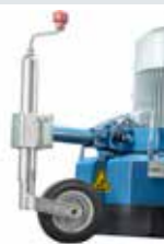
Transport wheel foldable