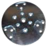
[ 1 ] Complete with tool holder