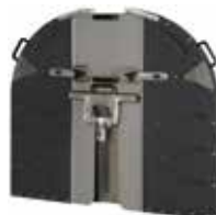
[ 1 ] Electric control unit+ radio remote control [ 2 ] V-Track feet alu