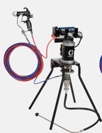
15:1 air-assist stand mount