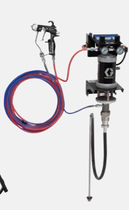
15:1 air-assist wall mount