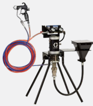
15:1 air-assist stand mount with hopper