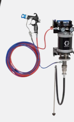
30:1 air-assist wall mount