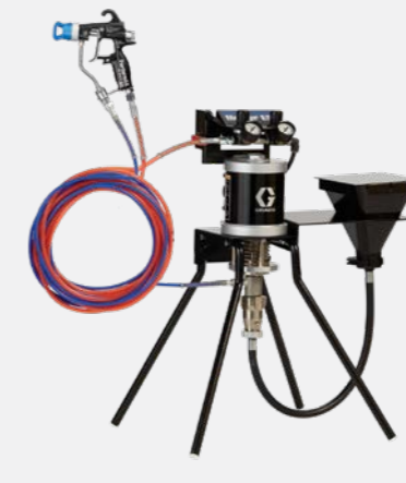
30:1 air-assist stand mount with hopper