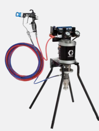
30:1 air-assist stand mount