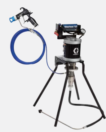
30:1 airless stand mount