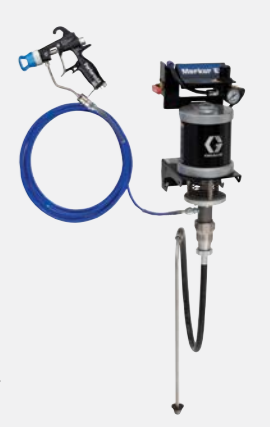
30:1 airless wall mount