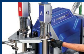
1) Remove retaining clamps and pressure transducer connections