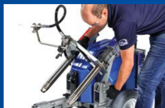
2) Tilt pump assembly back