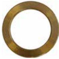
[ 1 ] Antifriction washer