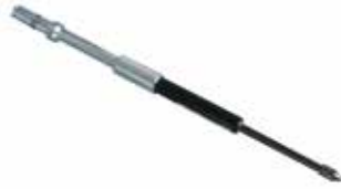
[ 2 ] Centre spike