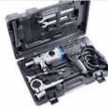
CDM 20 P incl. carry case