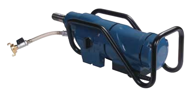
CDM 33 W