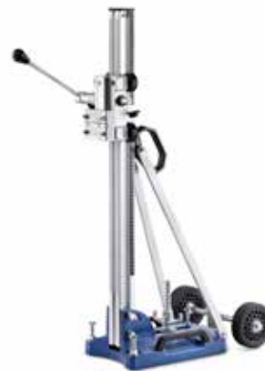
CDR 250 Image shows optional accessories