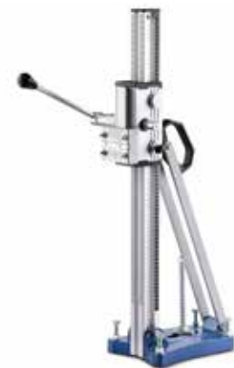
CDR 200 Picture without collar