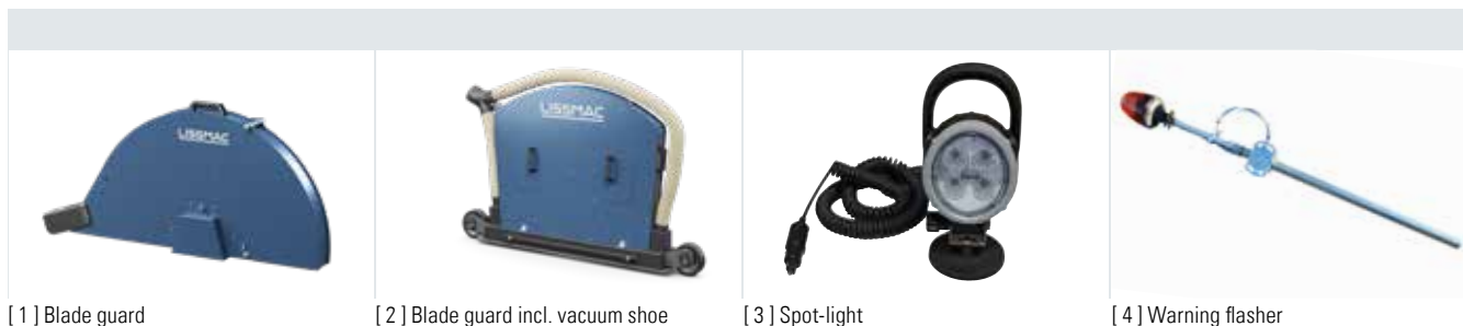
[ 1 ] Blade guard