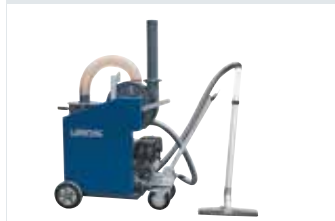
[ 1 ] VACUUM-WET 100 P