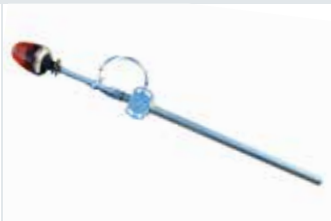
[ 4 ] Warning flasher