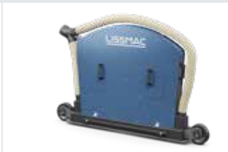
[ 2 ] Blade guard incl. vacuum shoe