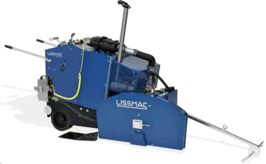
MULTICUT 605 Image shows optional accessories